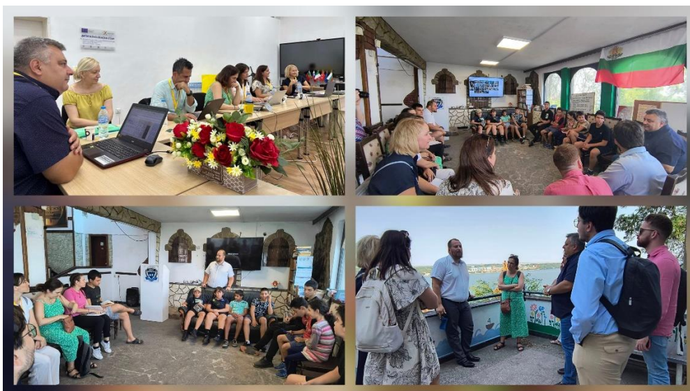
Meeting with local school principals and Svishtov municipality representatives