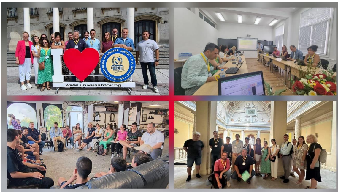
Partners at D. A. Tsenov Academy of Economics